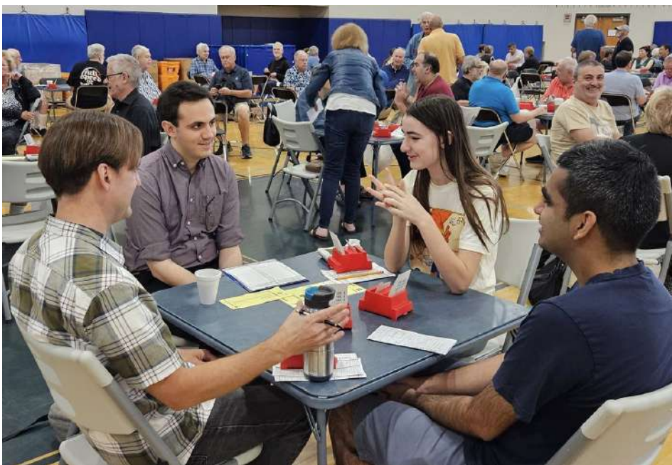
Players having fun at the Labor Day Sectional.